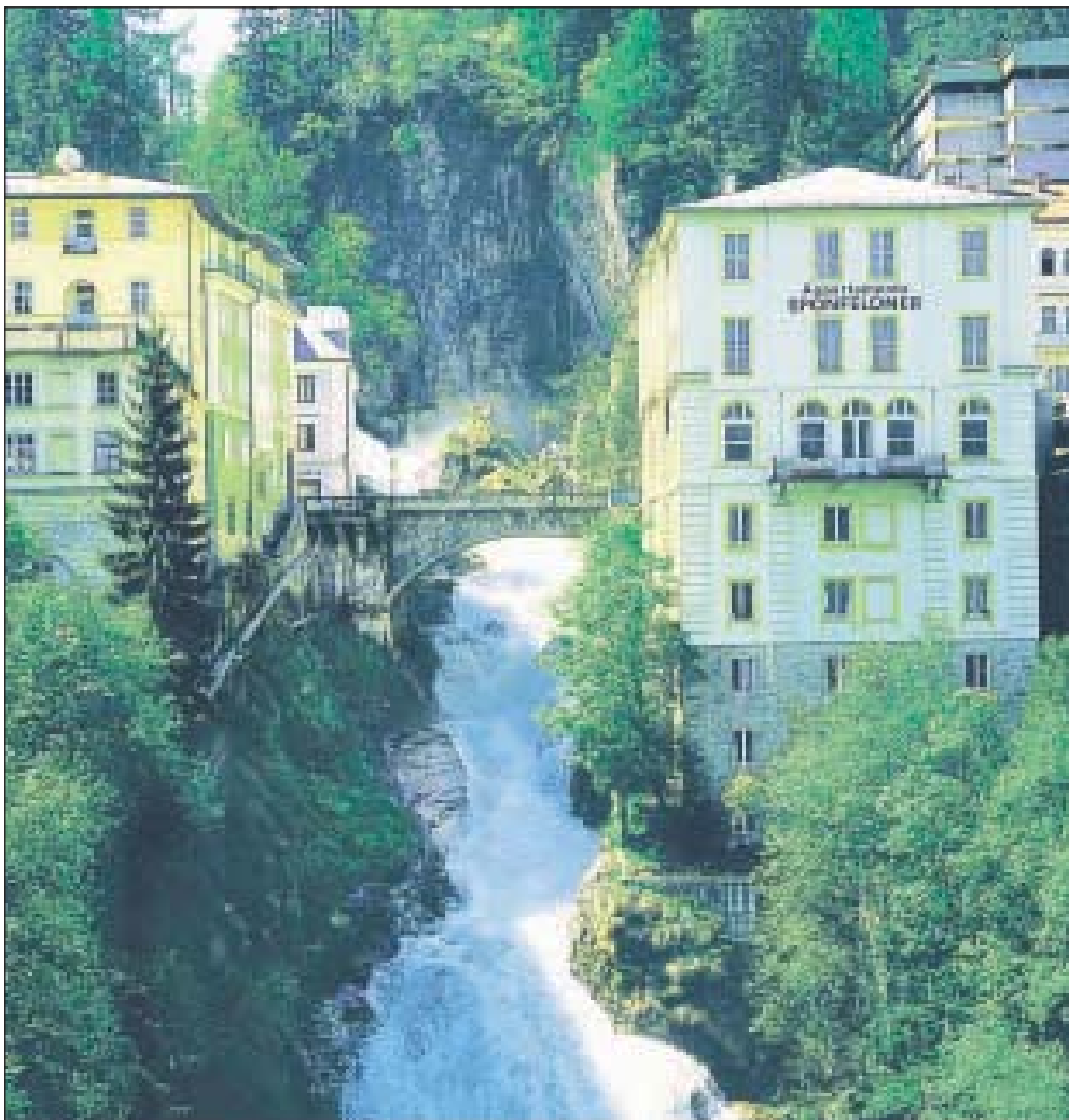
The Belle Epoque town of Bad Gastein, in the Hohe Tauern National Park, is dominated by a large waterfall